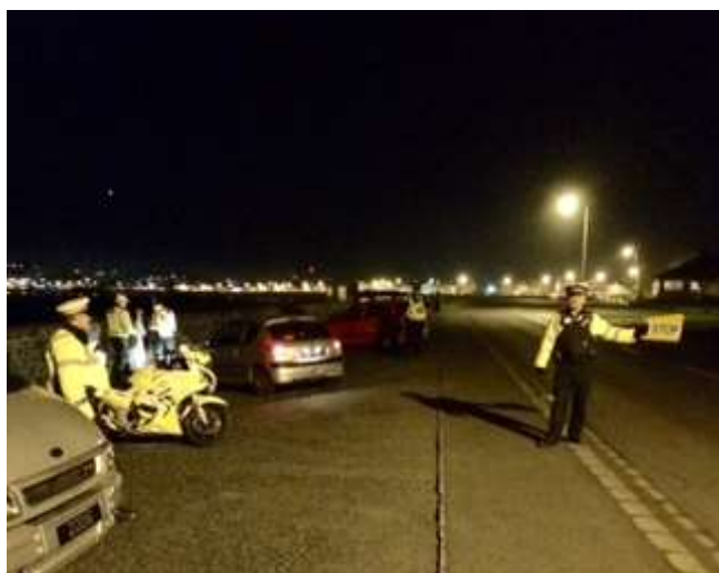
Roadside Stop-Check - Anti Drink Drive Campaign

Anti Drink Drive Campaign: The Neighbourhood Policing Team, together with officers from the Roads Policing Unit, conducted road side stop checks at various locations around the island as part of the Christmas Drink Drive campaign. Over 100 vehicles and drivers were checked and spoken to during the operation.