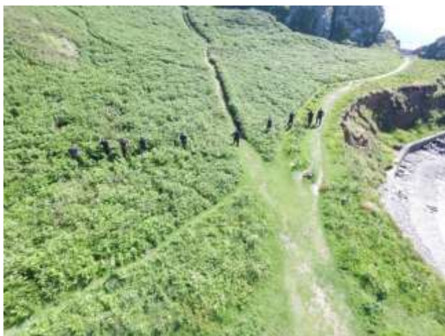
Search for missing person

Search for Missing Person: Following a missing person report, Police Officers commenced extensive searches, assisted by Civil Protection Volunteers and the Ambulance Service's inshore lifeboat in the Pleinmont area. Detailed and lengthy searches were conducted which also included specialist search dogs from the UK and a Jersey Fire Service drone. Sadly the body of the missing man was not found until later in the year.