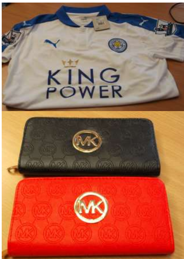
Examples of the Counterfeit items seized

Fake Goods: The first of 90 packages containing various articles suspected of being counterfeit and addressed to one local individual were identified by officers working at the post office. The relevant rights holders subsequently confirmed the goods to be counterfeit and the goods were surrendered for destruction. The items included fake Leicester City football shirts, Nike and Adidas trainers, and designer handbags and sunglasses. All the items were destined for sale through social media and local websites.