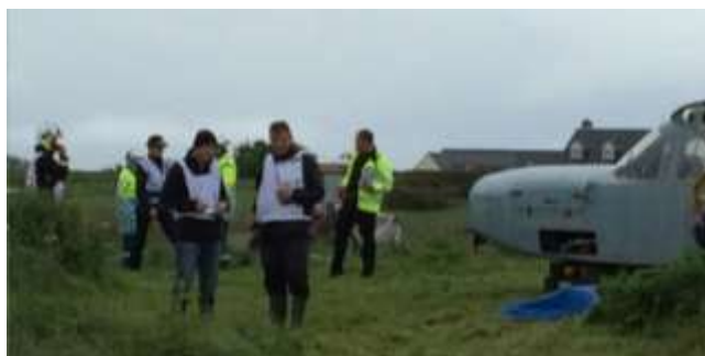
Alderney Major Incident Exercise

Alderney Major Incident Exercise: The aim of the exercise was to test the multi-agency response to a major incident. The exercise was based on an aviation incident with a number of serious casualties requiring medical evacuation, the convening of a Tactical Coordinating Group at the Harbour Office and the emergency accommodation plan being activated at the Island Hall.