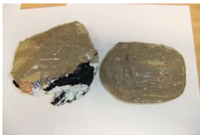
Packages containing Cannabis

Postal importation: A local man was arrested and charged with the importation of a quarter of a kilo of 'skunk' Cannabis. A search of his home address also identified he was in possession of a stun gun. He received a sentence of 2 years 1 month in total for both offences.