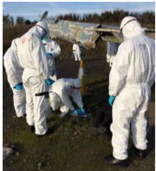
Disaster Victim Identification Training

Major Incident Training – Disaster Victim Identification (DVI): A number of officers were trained in body recovery and scene management which was delivered by UK DVI trainers. This was part of a development programme around the management of various scenes encountered during a major incident. Police took part in a variety of exercises throughout the year working with Harbours, Airport, other emergency services and Civil Protection Volunteers in various training scenarios.