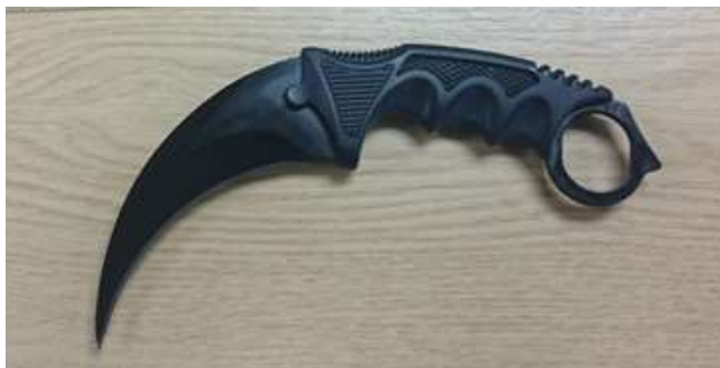
Knife seized under import controls