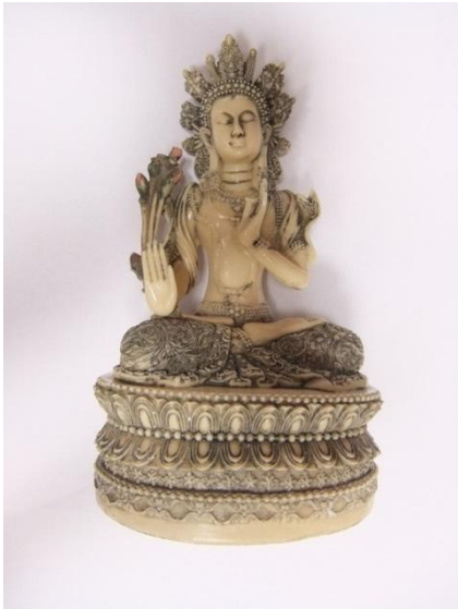
Statue used to conceal herbal cannabis.

Cannabis importation: GBA officers stopped and searched a 71-year-old man on arrival from Gatwick. During the search of his luggage, officers inspected a gift-wrapped statue which was found to contain approximately 52 grams of herbal cannabis. The man was charged with the importation of a Class B controlled drug and sentenced to 12 months imprisonment.