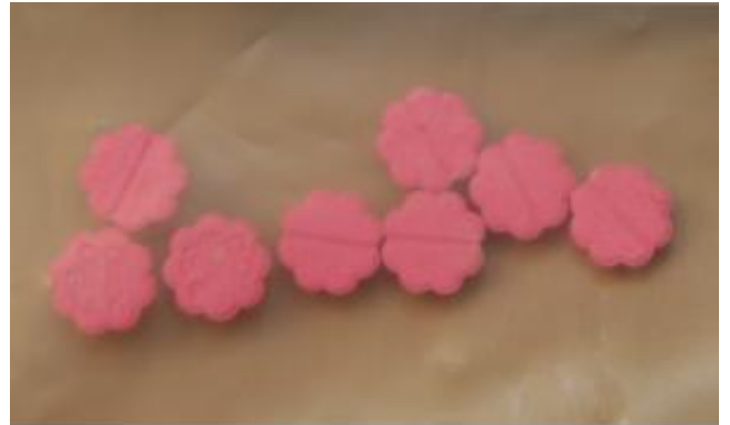
Pink pills believed to be the Class A drug ecstasy

Drugs: Police officers arrested a 29-year-old local man found to be in possession of a number of pink pills, believed to be the Class A drug ecstasy. The man was subsequently charged with possession with intent to supply and the case is currently progressing through the judicial system.