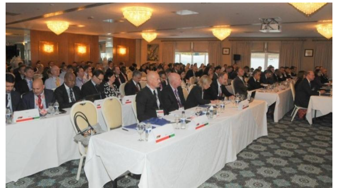
CARIN Annual General Meeting held in Guernsey

Camden Asset Recovery Inter-Agency Network (CARIN): Around 150 law enforcement and judicial practitioners from over 60 jurisdictions travelled to Guernsey for the Camden Asset Recovery Inter-Agency Network (CARIN) Annual General Meeting. Attendees discussed and shared knowledge on ways to improve cross-border identification, freezing, seizure and confiscation of illicitly acquired assets, including the creation and delivery of a new website. The event further enhanced Guernsey's position in the top tier of jurisdictions committed to asset recovery.