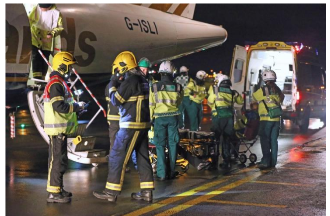
Major incident training exercise

Major incident training exercise: Officers participated in a large multi-agency exercise, designed to test the current emergency response and procedures of relevant services should an incident occur at the airport. It also gave commanders the opportunity to practice joint, inter-agency, working in a realistic environment. The Airport Fire Service, airport operations staff, Fire and Rescue Service, Ambulance Service, Joint Emergency Services Control Centre, Civil Protection Volunteers, Red Cross, Raynet, Hospital Accident and Emergency, police and 40 casualty actors took part. A Survivor Reception Centre and Hospital Reception Centre were activated and tested.