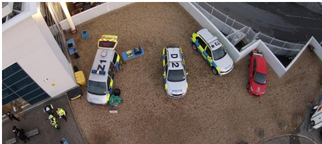
Joint recruitment open evening