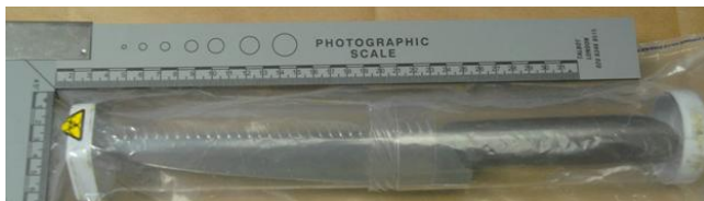
One of the knives used in the domestic incident

Domestic incident – knives: Police were called to a domestic incident in the early hours. On arrival they were met by a 27-year-old man wielding two large knives, who was threatening to harm himself and officers. After a period of negotiation armed officers deployed less lethal options (Taser) and the man was safely arrested. The man was later charged with public order offences.