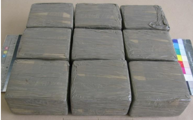
Packages containing 10 kilograms of cannabis resin found in the spare tyre of a car

Cannabis importation: Border officers stopped and searched a UK-registered vehicle that arrived by ferry from Poole. A search of the vehicle revealed 10 kilograms of cannabis resin concealed in the spare tyre. The driver of the vehicle was charged with the importation and sentenced to six years imprisonment.