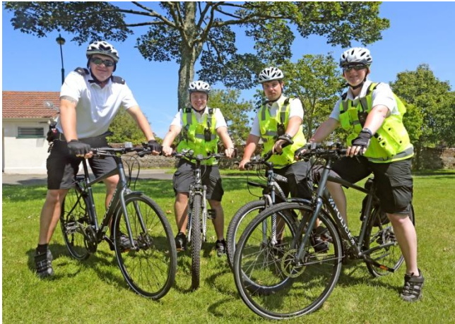
Members of the Neighbourhood Policing Team's seasonal Cycle Team

Neighbourhood Policing Cycle Team: Six police officers joined the Neighbourhood Policing Team (NPT) for the summer as part of the unit's dedicated Cycle Team. The officers were deployed to carry out a wide range of roles, including traffic operations, community policing and visiting schools. Travelling everywhere by bike, the increased visibility was welcomed by the community.