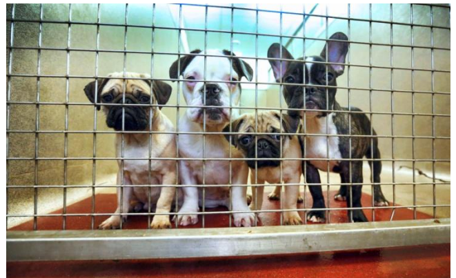
Some of the rescued puppies

Animal cruelty: A 59-year-old man and 27-year-old woman were arrested after concerns for the welfare of 25 puppies being transported from Slovakia to the UK via Guernsey. The man was found guilty of animal cruelty and fraud and was fined £2,500. The puppies were rescued and rehomed.